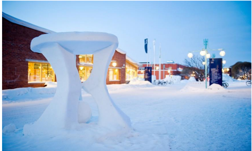
Luleå University of Technology (Sweden)

The project partners held a very successful meeting in Luleå, Sweden from 03 to 05 October 2017 which included presentations on Virtual Reality (VR) and Building Information Modelling (BIM).